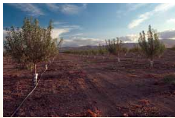
Young almond orchard